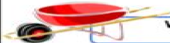
Wheel and Axle