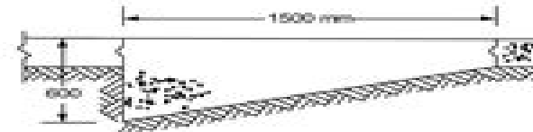
Gambar 17 Angker blok