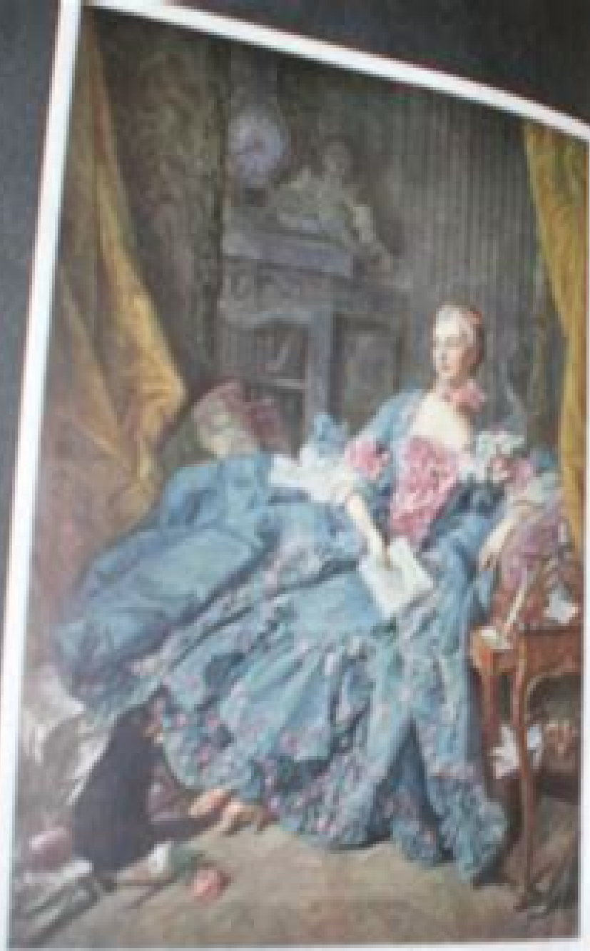
MARQUISE DE COMPARON