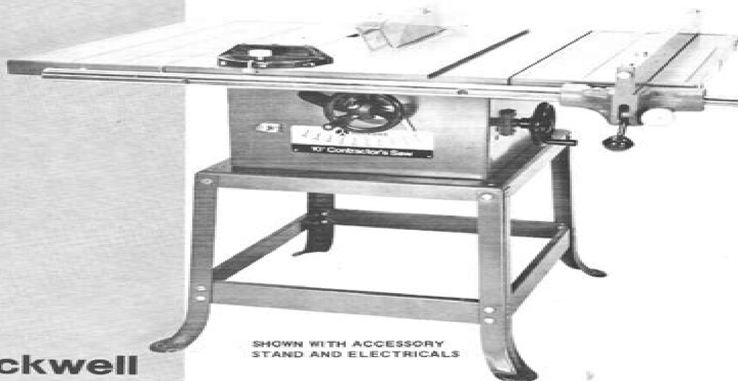
SHOWN WITH ACCESSORY STAND AND ELECTRICALS