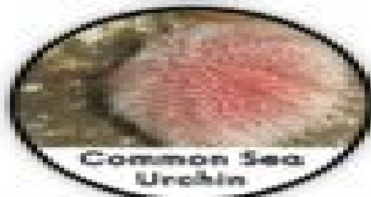
Common Sea Urchin