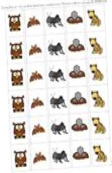
Stencils: Mole, Bat, Raccoon, Cat, Spider