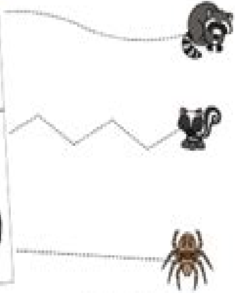
Stencils: Raccoon, Cat, Spider