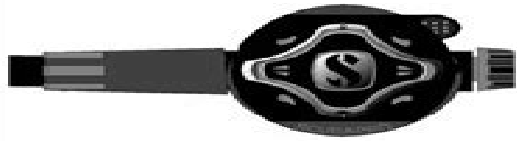
S600 Configuration B

USE THIS GUIDE AS A REFERENCE WHEN SERVICING THE S600 AND S550 SECOND STAGES