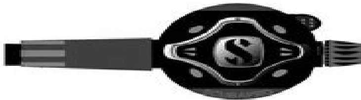
S600 Configuration A