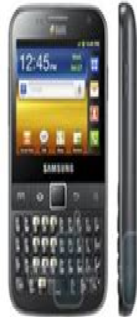
Samsung Galaxy Y Pro DUOS 4.36 x 2.5 x 0.47 inches 110.8 x 63.5 x 11.9 mm