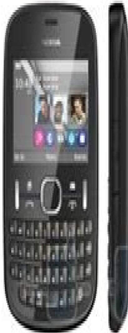
Nokia Asha 200 4.54 x 2.41 x 0.55 inches 115.4 x 61.1 x 14 mm