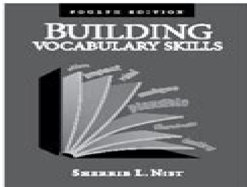
BUILDING VOCABULARY SKILLS, 4/e