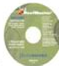
SL14129 - CD includes Camera Driver, MGR Protocols & Instruction Manual