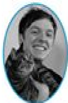
Sam is the author's cat's cat. He enjoys long walks, beam jacks and sitting in the bath.

Rude Vile Pigs is a satirical black comedy set in the city of Sadukitepeopledrinking, and follows the antics of Jim Joy, a middle-aged alcoholic who accidentally creates a religion dedicated to selfishness.