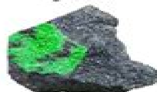
uvarovite on rock