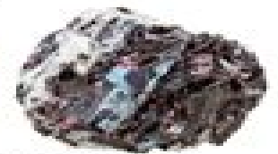
kyanite, biotite, tourmaline on gneiss