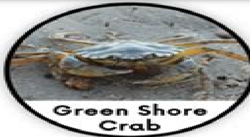
Green Shore Crab