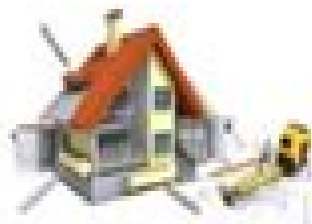
PROPERTY MANAGEMENT OFFICE