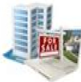
DEVELOPER/ REAL ESTATE SELLING