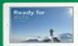
Student's Resource Centre with class audio