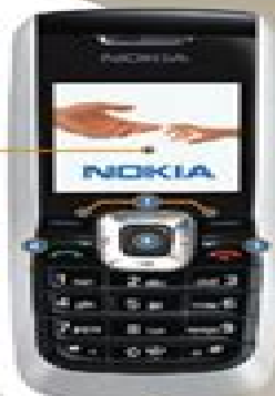
See Figure 2-1