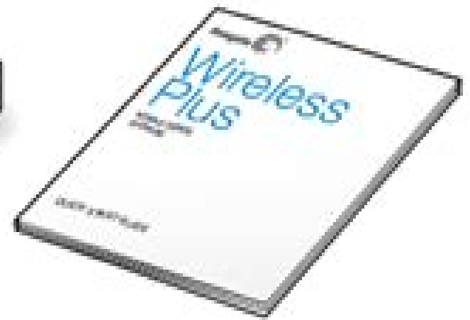
Quick Start Guide