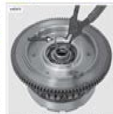
Figure 5-31 Clutch Hub Retaining Ring