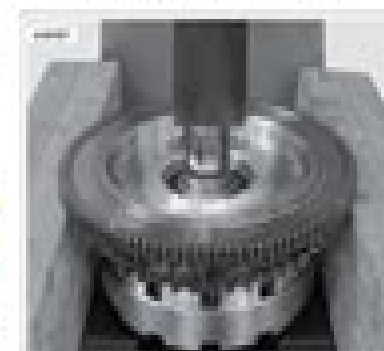
Figure 5-32 Pressing Clutch Hub from Bearing