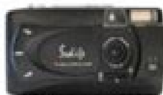
SL14101 - Sealife 3.3mp digital camera