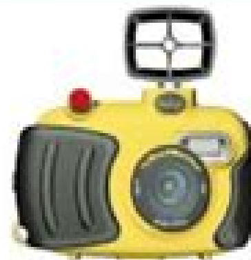
SL113 - Sealife Easy-Dig underwater housing - with wrist strap attached or SL118 - Sealife Advanced Housing