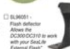
SL96051 - Flash deflector Allows the DC300/DC310 to work with your Sealife External Flash*