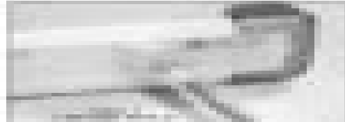
Mapbox hardware component

Hardware Installation Notes: - The hardware components are compatible with Windows and Linux. - The hardware components are compatible with 32-bit and 64-bit systems.