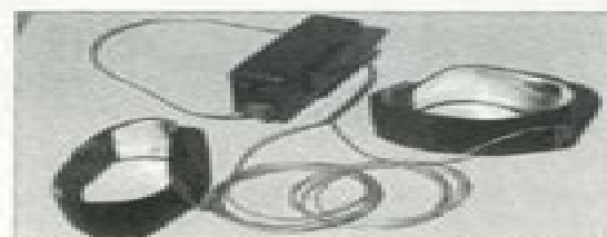
Photo A. The Bioelectrifier with belt clip and ankle electrodes.