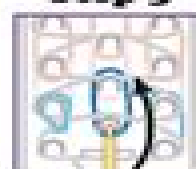
Grab the blue band on the center pin