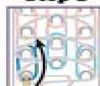
Grab the blue band on the left pin