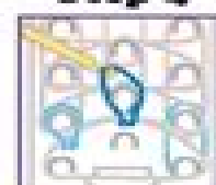
Loop the blue band straight up to the next pin