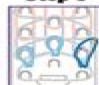
Loop the blue band straight up to the next pin

Step 7: Continue picking up and looping the bands until you reach the top of the loom. Finish the bracelet with a white extension and C-clip. (see reverse)