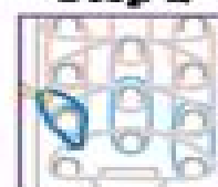
Loop the blue band straight up to the next pin