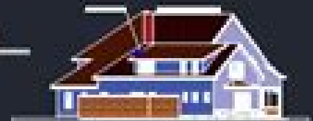
EASTMAN HOUSE SOUTH ELEVATION