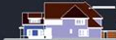
EASTMAN HOUSE WEST ELEVATION