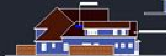
EASTMAN HOUSE EAST ELEVATION