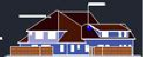
EASTMAN HOUSE NORTH ELEVATION