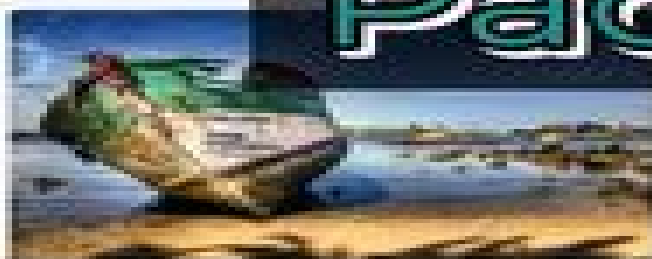
Unit 4: Swift and Defoe