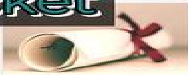
Unit 5: Semester Wrap-Up