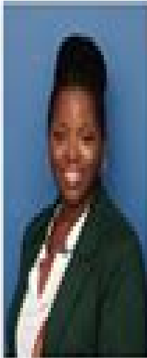
Robin L. Williams Middle Branch School