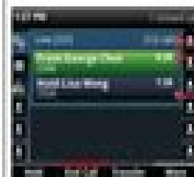
No. of Calls

If your phone has one or more calls, you can access Calls view.