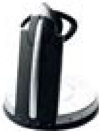
Jabra GN 9300 Duo