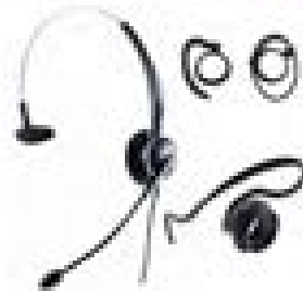
Jabra GN 2100