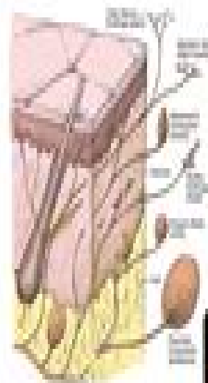
Figure 4.13 (continued)

A cross-section of the brain showing the location of the hypothalamus.