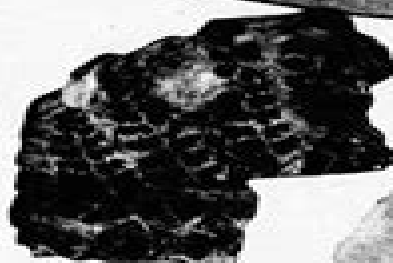
Interesting Fossil of a Tropical Fern dug Up in Greenland, Showing That There Was Once a Warm Climate and Tropical Vegetation Where the Glaciers Are Now Making Aways.