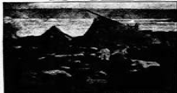
Photograph of Land Which Has Appeared for the First Time Greenland, and Which Has Always Hitherto Been Buried Under the Glaciers Which Are Now Melting Away.