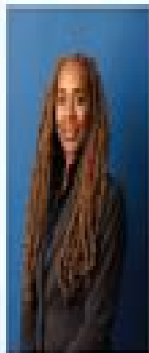
Regina Sharpe Ave High School