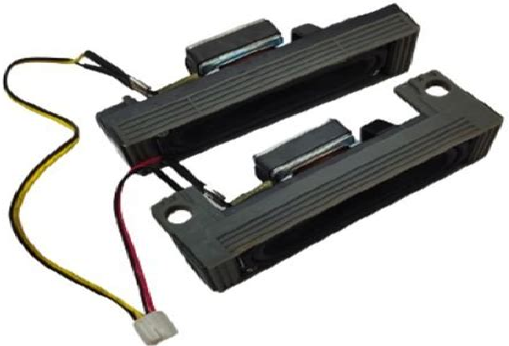
Samsung Speaker for LCD/LED TV