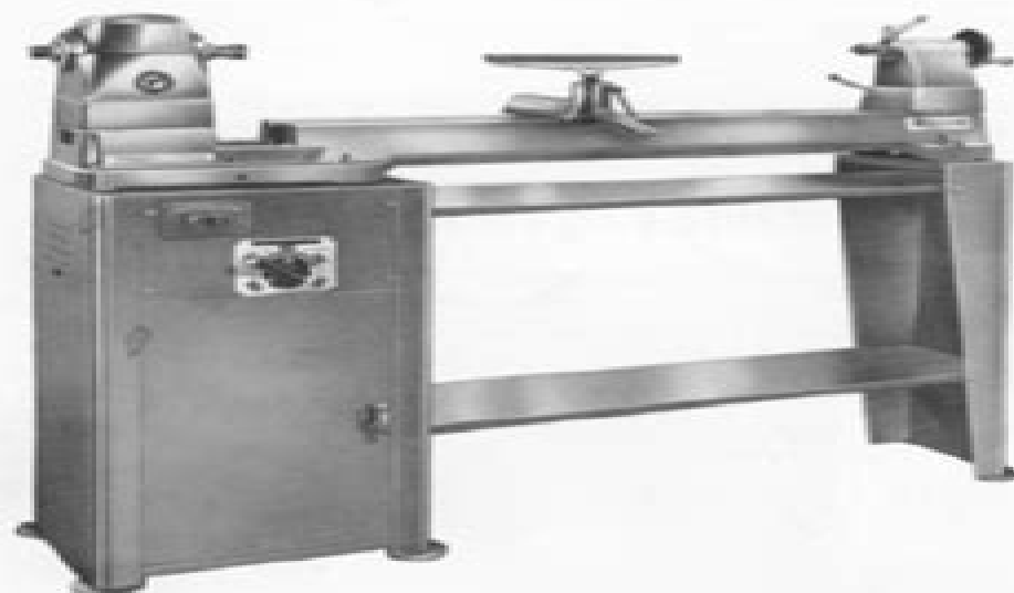
VARIABLE SPEED MODEL