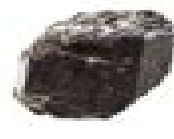
schorl (black tourmaline)