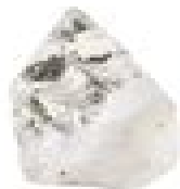
rock-crystal (clear quartz)