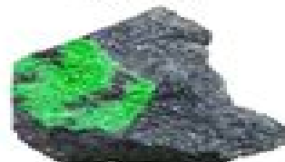
uvarovite on rock