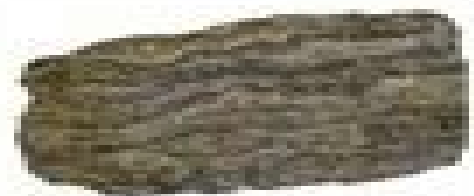
With lines in it