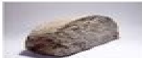
Flat on one side