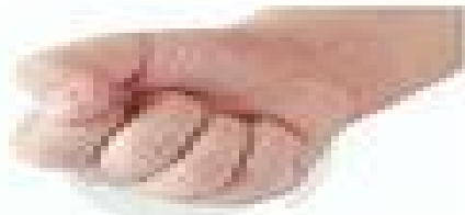
The size of your fist