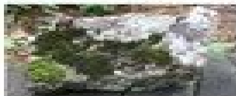
Moss or algae on it