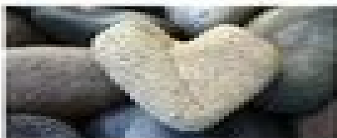
Shaped like a heart