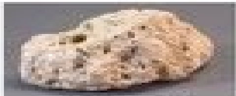
Holes in it