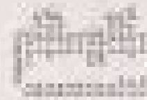
FIG. 1—Schematic Diagram of Roberts' Radio Model R77