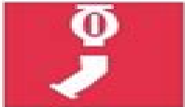
Fire Department Automatic Sprinkler Connection — Single