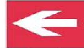
Directional Arrow *