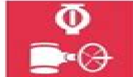
Automatic Sprinkler Control Valve