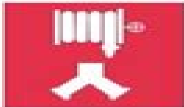
Fire Department Standpipe Connection