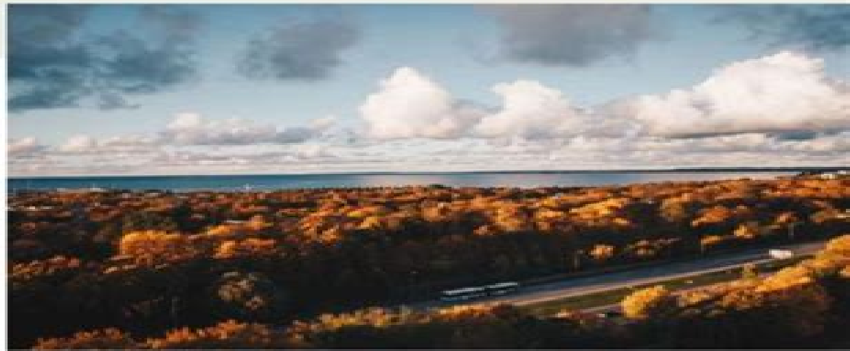
PICTURE CAPTION: Lorem ipsum dolor sit amet, consectetur adipiscing elit. Fusce vel laoreet orci. In eget auctor mi.