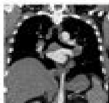
Figure 2: Coronal CT