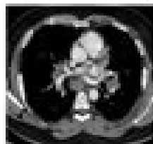
Figure 1: Axial CT