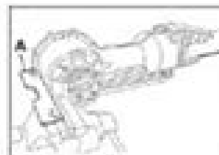
Clamping fluid drive