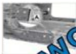
Determining the cut

→ The cut must not obstruct the openings (holes).