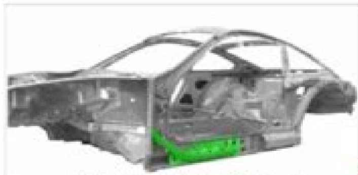
Installation position of lower side member reinforcement