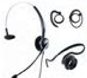
Jabra GN 2100