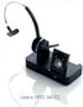
Jabra PRO 9400