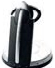
Jabra GN 9300 Duo