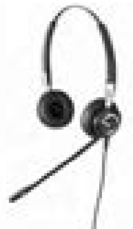
Jabra BIZ 2400 Duo