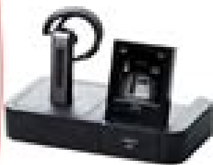
Jabra GO 6400