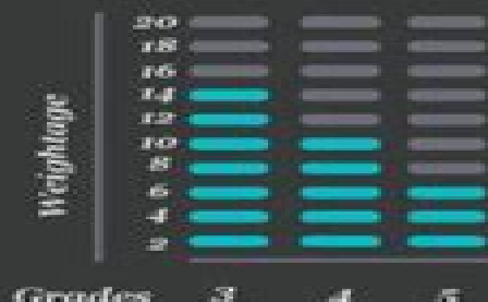
Operations and Algebraic Thinking (OA)