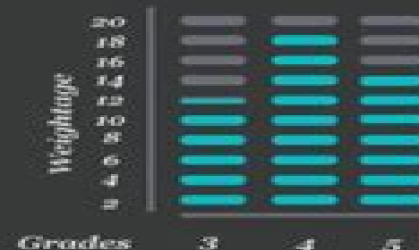
Number and Operations – Fractions (NF)