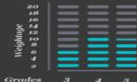
Number and Operations in Base 10 (NBT)