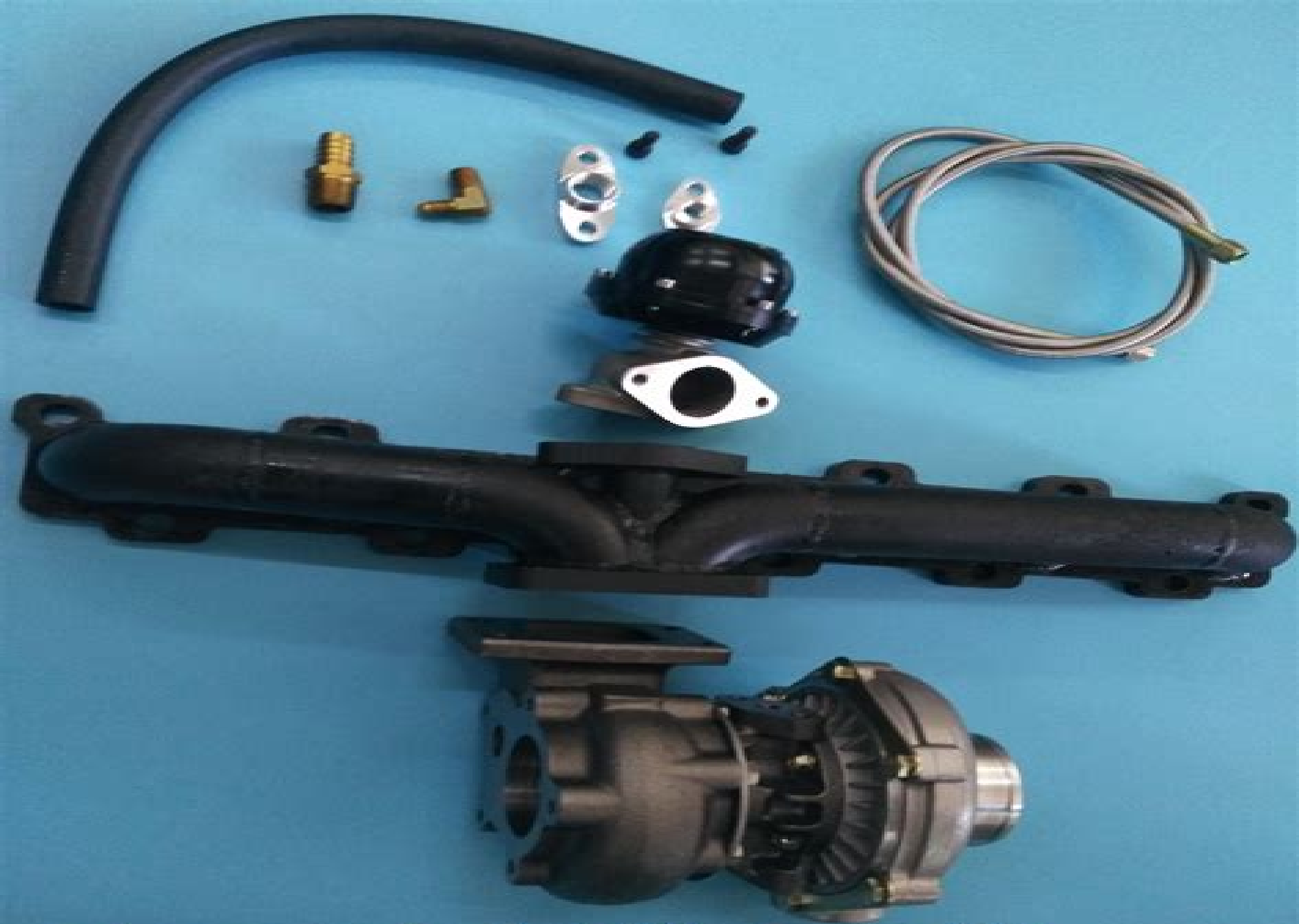
nissan patrol td42 turbo kit