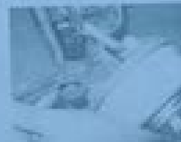
2-2 assemble with