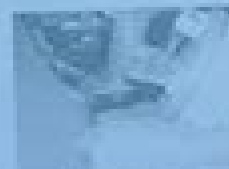
1-3 assemble with