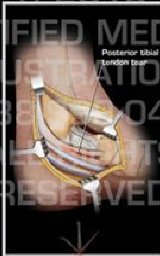
C. Repair of Posterior Tibial Tendon Tear with Graft Tendon