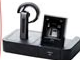
Jabra GO 6400