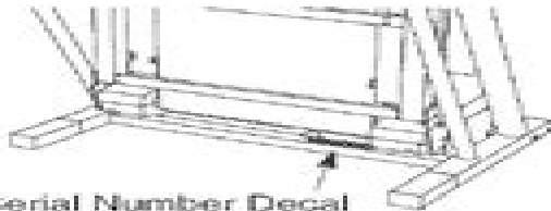
Serial Number Decal

Find the serial number in the location shown below. Write the serial number in the space above for reference.