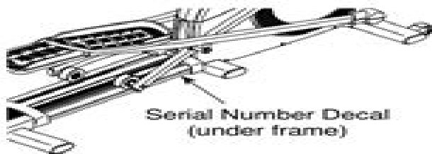
Serial Number Decal (under frame)

Write the serial number in the space above for reference.