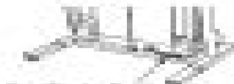
Illustration of C2100

For information on the location of the nearest service center, please contact your distributor or write to: