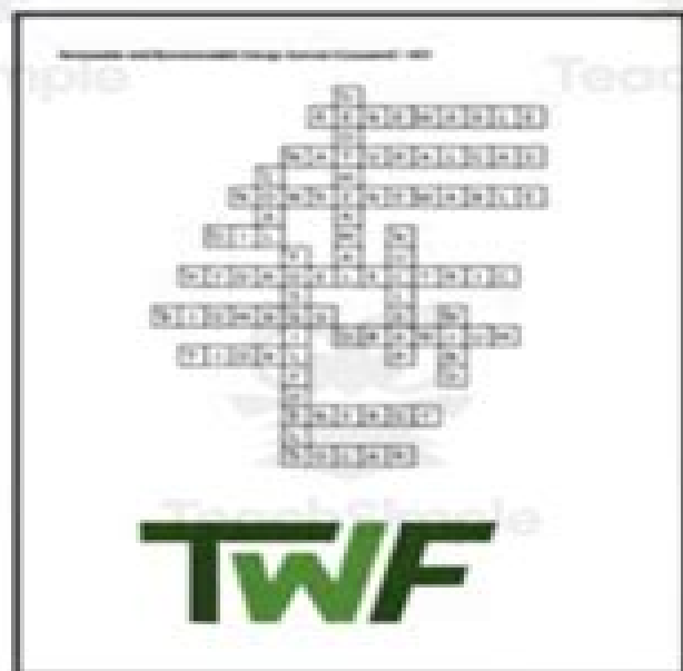
Full Answer Key