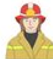
Illustration vs Photograph